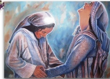
Blessed is the fruit of your womb.